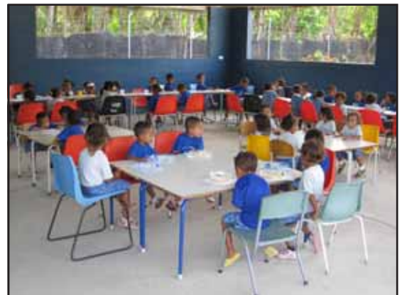
The new dining area