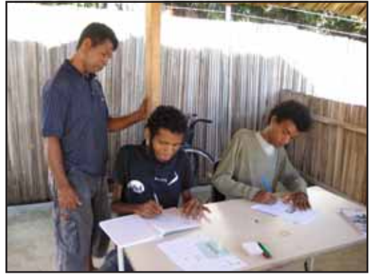
Learning to read and write