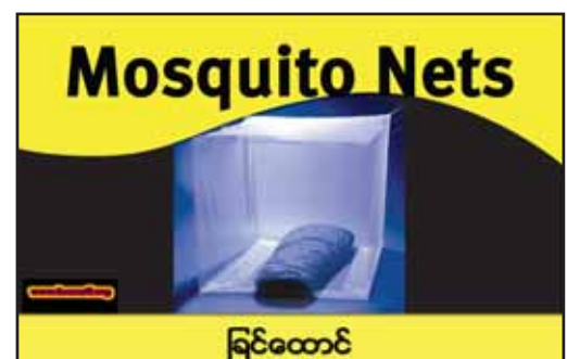
Mosquito Net Flip Chart in Burmese

We are hoping that the funding we are seeking will allow us to distribute mosquito nets, provide clinics with anti-malarial medicines and help local clinics to have access to and use RDTs. Donations to Buzz Off can be made either online or by sending funds to the ARMS National Office PO Box 1212 Surrey Hills North Vic, 3127.