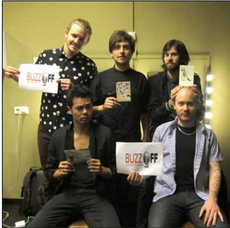
The Temper Trap

The Buzz Off Online Store was selling nets and dozens of nets were distributed through Mozzie Net bank.