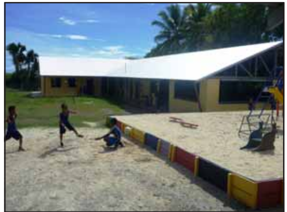
The new school building