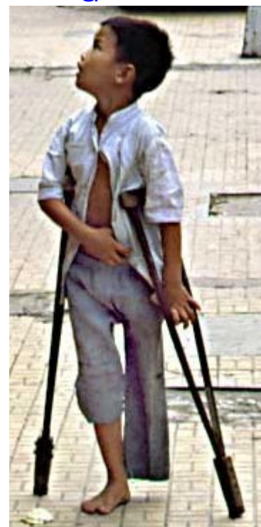
A Lot Of Victims Are Only Kids

Phone: 08 8387 7501 mfromm@picknowl.com.au