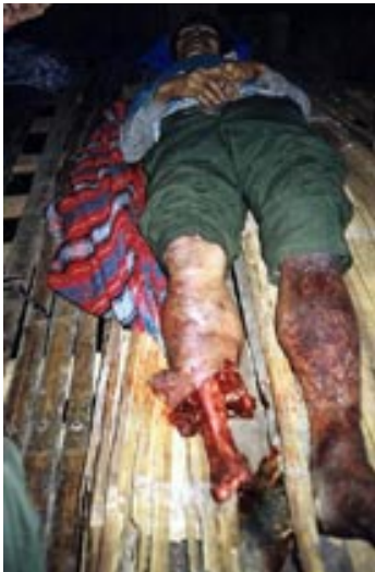
The Stark Realities Of Landmines.

It is a well known fact that land mine victims can be treated like lepers, even in the communities in which they live. This was made clear to me when I visited Cambodia four times between 1997 and 2000. In the churches that I was visiting, I noticed that there were no landmine victims in the congregations. What was a real shock to me, was the fact that the local pastors who translated for me would not speak to the limbless beggars on the streets, and no church outreaches were planned for these poor rejected people. When I asked one pastor about this, he told me that local congregations would not accept landmine victims if they came to their churches. He explained that the rejection by the local people was part of the Buddhist mindset that sees imperfect people as worthless. When I heard this it nearly broke my heart. I challenged this pastor and his church of the need to reach out to these people, but subsequent visits showed me that nothing had changed. The plight of the landmine victims became a deep concern in my heart for years; but I wasn't sure what to do.