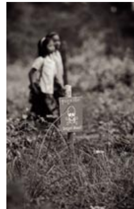
Children Going To School Close To A Mine Field

instances of injury being suffered through landmines, there are increasing numbers of people begging in the towns and cities all over Cambodia. There are currently more than 300,000 victims in Cambodia, with an increase of approximately 500 per month. At the current rate of detection and demolition, it will take more than 40 years to eradicate all the land mines in Cambodia. As you can see, this is a serious long-term problem that cannot be ignored.