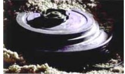
Less Than The Size Of A Dinner Plate; Yet The Damage They Do Is Horrendous

Reverse The Curse has the potential to become a prototype for other places to emulate in their care for people with land mine related disabilities. Not much is currently being done to give amputees employment and self-esteem in Cambodia and other countries where there are land mines. Usually begging is their only source of income, if they cannot work on the family farm, but it is soul destroying and with the ever-increasing