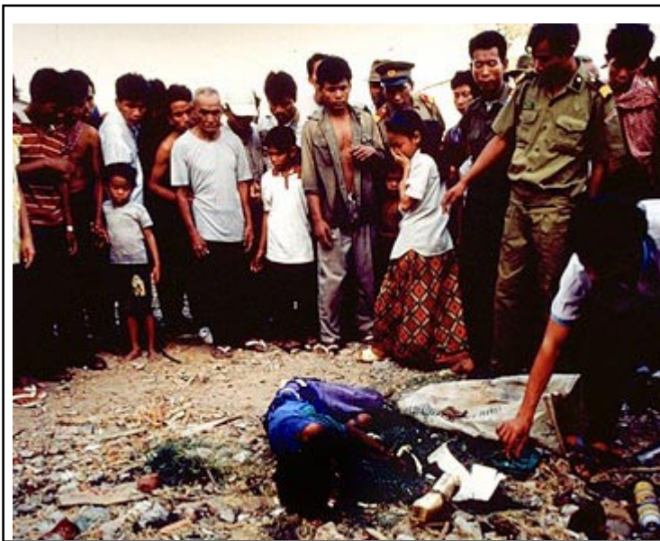
Local Community Members Gather Around Their Latest Land Mine Victim

Reverse The Curse Of Landmines is a small group of people who are not only concerned about the Landmine problem in Cambodia but they are determined to do something about it. The vision of Reverse The Curse (RTC) is to set up a business in Cambodia that will provide employment and care for the victims of landmines. By providing employment RTC will help each victim in its care to better provide for themselves and their families. This we hope will help restore some of their dignity.