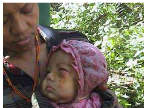
Some of the SPDC's victims.

An FTA with Burma flies in the face of appeals made by Nobel laureate and democratically elected president of Burma Aung San Suu Khy (who has spent years under house arrest courtesy of the SPDC). She has asked foreign governments not to deal with the current regime. Although her appeal seems to have fallen on deaf ears as far as ASEAN is concerned. Recently the secretary of ASEAN said that the ASEAN nations respected each other enough not to comment on each others' internal governance or human rights policy . Something is clearly wrong here. Does this mean that as long as an ASEAN member state obeys the trade rules that it can do as it likes to its people?