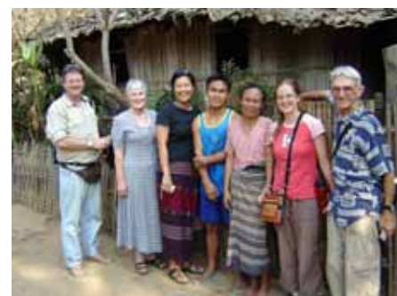
The team in Mae-la refugee camp.