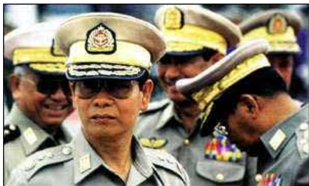
Members of Burma's ruling military junta. Do we really want to trade with them?

“the SPDC are responsible for the worst genocide of the twentieth century”