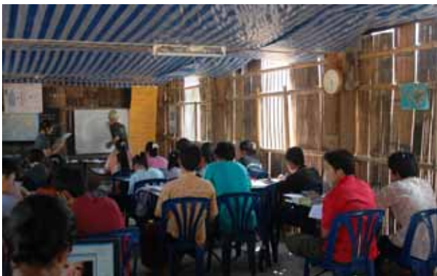
In the class room

So as not to confuse the graduates of this course with the already existing primary health care workers who are more highly trained we have given these graduates the title of Primary Health Care Volunteers . It is only after they have completed a second course that they will be able to use the title Primary Health Care Worker .